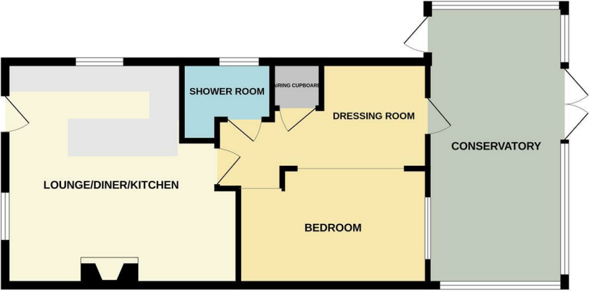
ONE BEDROOM BUNGALOW TOTAL FLOOR AREA : 635 sq.ft. (59.0 sq.m.) approx. Whilst every attempt has been made to ensure the accuracy of the floorplan contained here, measurements of doors, windows, rooms and any other items are approximate and no responsibility is taken for any error, omission or mis-statement. This plan is for illustrative purposes only and should be used as such by any prospective purchaser. The services, systems and appliances shown have not been tested and no guarantee as to their operability or efficiency can be given. Made with Metrepro ©2025.

Littlehampton is a charming seaside town sheltered by the South Downs and providing a range of amenities to suit individuals, couples and families of all ages. The town benefits from two beaches with the popular East Beach providing a long promenade, family fun at Harbour Park, the award winning East Beach café, childrens playground and many other highlights. West Beach offers a quieter experience with the unspoilt grassy sand dunes offering ideal dog walking opportunities as well as watersports for those seeking adventure.